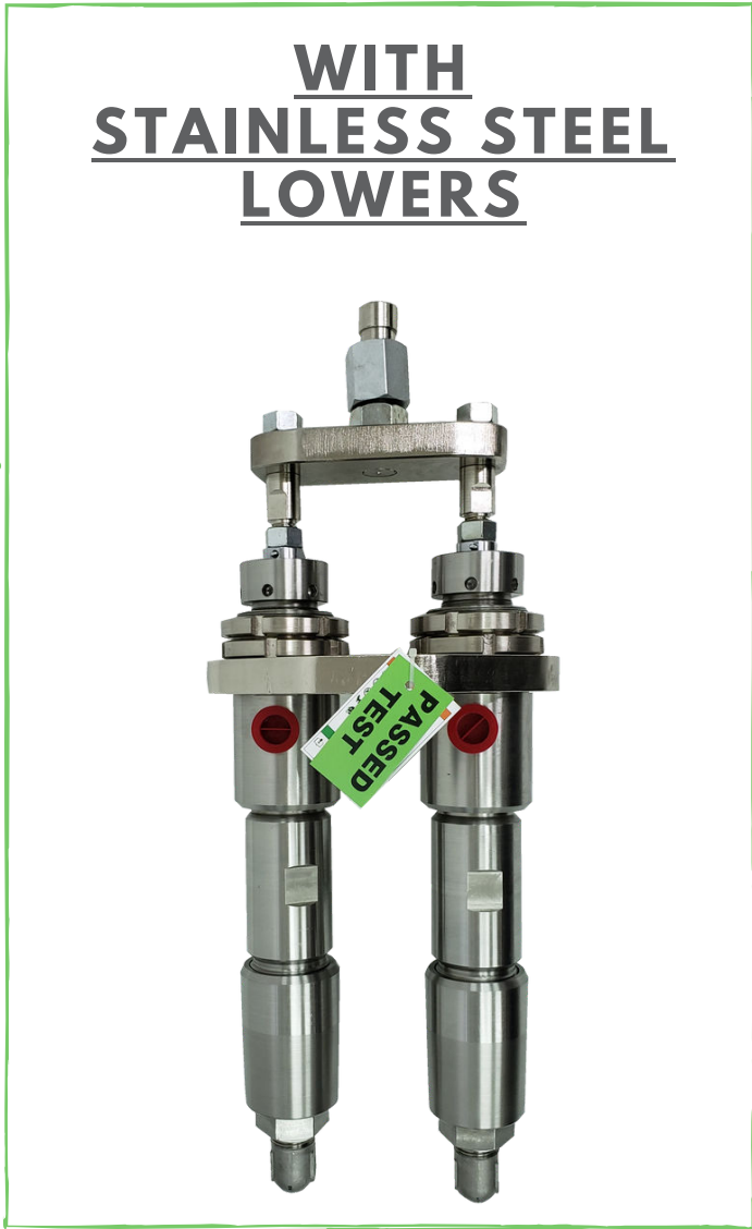
TECHNICAL DATA (Part No: SD100-X30-11-SUS-WO-P1312)