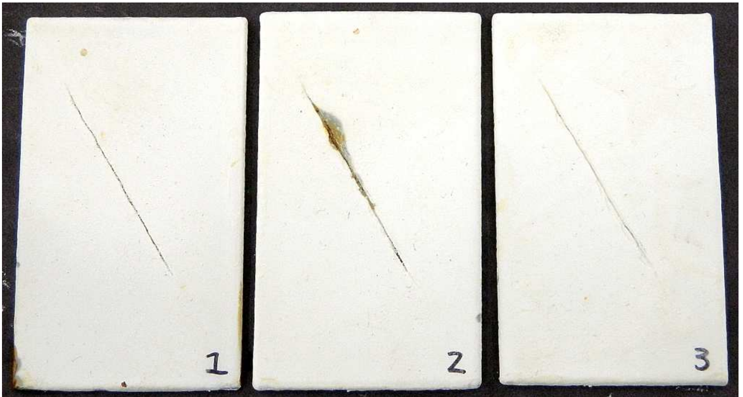
Sample at 1500 hour exposure IAW ASTM B117-11. (See above.)