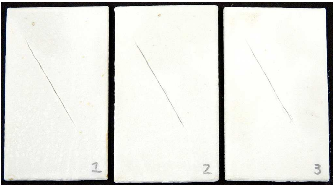
Samples at 500 hour exposure IAW ASTM B117-11. (See above.)