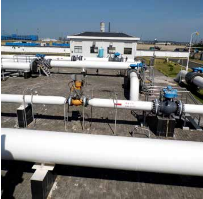
The utility protects in use, wet pipeline with an anti-corrosive, water based, ceramic coating with no VOCs or HAPs

When an electric utility in the Southeastern United States sought to protect above-ground natural gas pipeline against corrosion, the goal was to cost effectively do so while minimizing downtime and environmental impact.