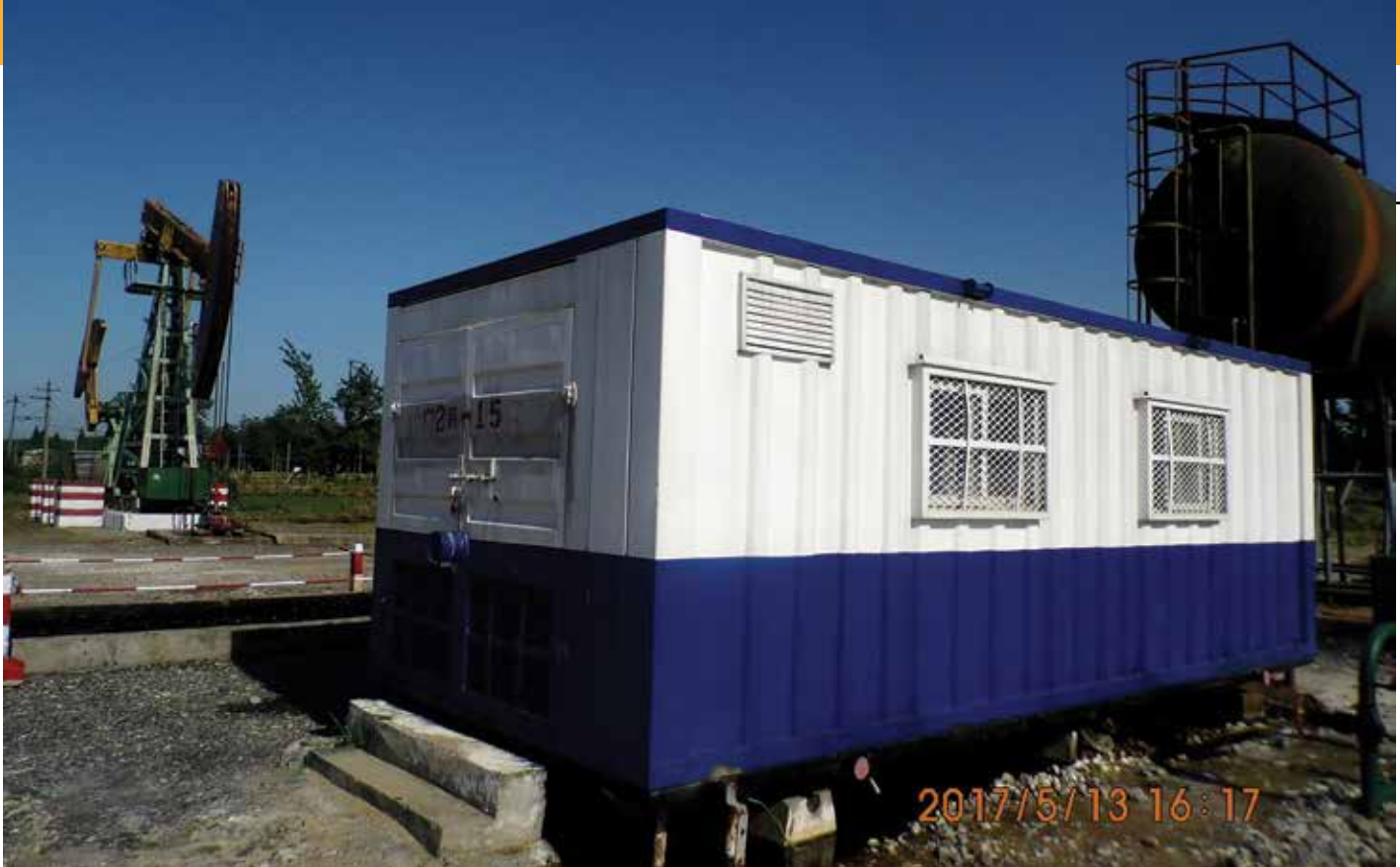
Some of the world's largest petrochemical companies are finding success with a new approach toward stopping CUI and corrosion.