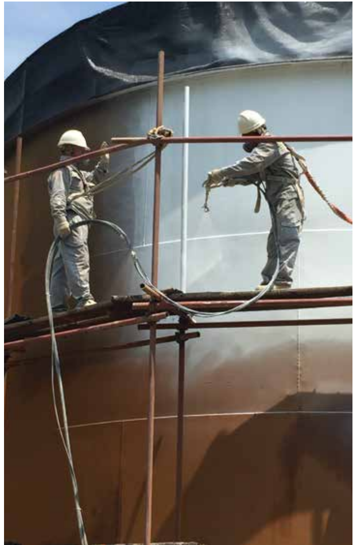
Some of the world's largest petrochemical companies are finding success with a new approach toward stopping CUI and corrosion.

The corrosion barrier is covered by a ceramic layer that further resists corrosion, water, fire, abrasion, impact, chemicals, and temperatures up to 400 °F. Beyond this, the ceramic serves a unique role that helps to end the costly maintenance