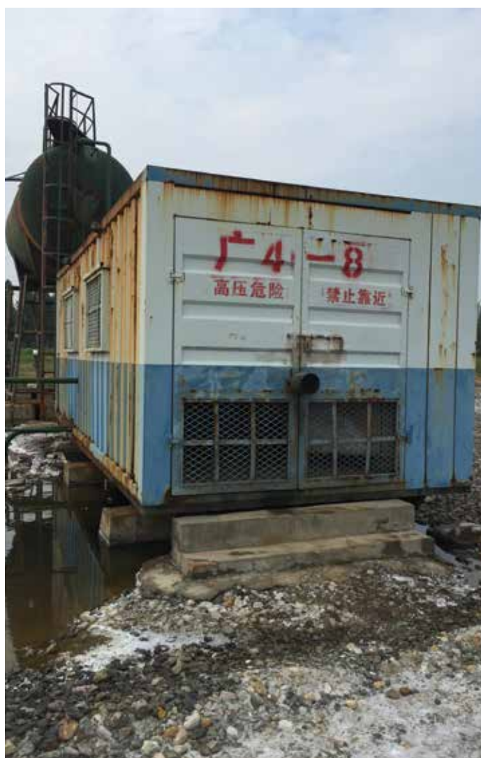
Fighting CUI and major corrosion has been an uphill battle and a major cost in the operation of oil and gas facilities.

With traditional coatings, extensive surface preparation is required and done a little at a time to avoid surface oxidation, commonly known as "flash rust," which then requires re-blasting. But with the CBPC coating, the flash rust is actually desirable. There is no need to "hold the blast." The reason for this unique CBPC characteristic is due to the presence