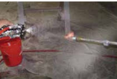
EonCoat has a flame rating of zero which can help prevent flame spread on coated walls, ceilings, equipment, cargo holds or wherever a fire barrier is needed

For decades, industrial facilities have measured the effectiveness of a coating by its ability to prevent corrosion, which, of course, is its fundamental purpose. However, with the increasing awareness of the dangers of traditional organic-based coatings and the serious health risks posed to coating contractors, many facility safety managers are specifying safer, inorganic options that now exist on the market.