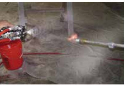
EonCoat has a flame rating of zero which can help prevent flame spread on coated walls, ceilings, equipment, cargo holds or wherever a fire barrier is needed

For decades, industrial facilities have measured the effectiveness of a coating by its ability to prevent corrosion, which, of course, is its fundamental purpose. However, with the increasing awareness of the dangers of traditional organic-based coatings and the serious health risks posed to coating contractors, many facility safety managers are specifying safer, inorganic options that now exist on the market.